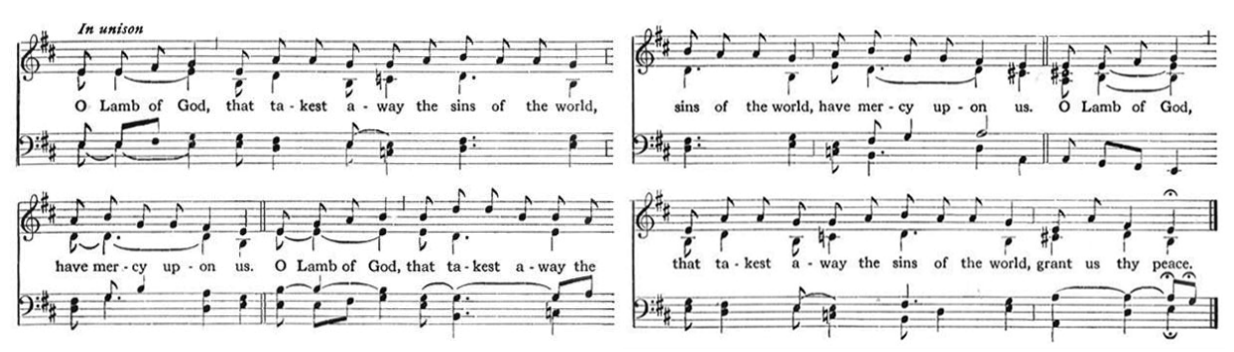
The Distribution of Communion

(All baptized Christians are welcome to receive)